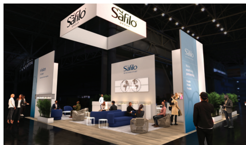
Safilo Group's newly designed booth provides a welcoming and inviting environment.

The open concept booth will provide a very welcoming and inviting environment with seating areas to meet, greet and reconnect with Safilo, anchored by four free-standing focal walls. The front area of the