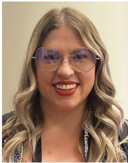
Bethany Davidson Vision Institute Northwest Spokane, Washington

What motivated you to come to Vision Expo West and what courses are you taking?