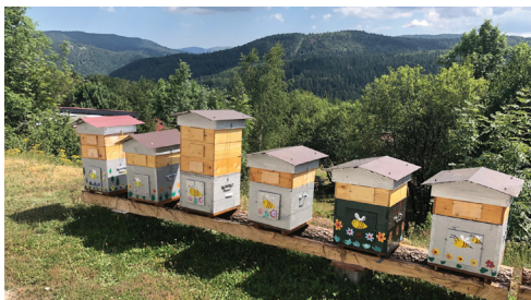
Morel partners with local beekeepers, making its headquarters home to 12 beehives.

About 80 percent of the stainless steel Morel uses is recyclable, and all frame bags are biodegradable. The latter has allowed Morel to eliminate