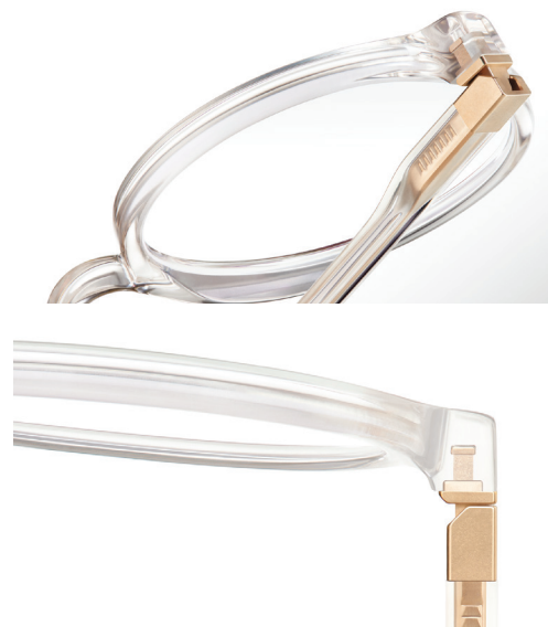
Mykita announced a partnership with Eastman earlier this year, and will exclusively source Eastman Acetate Renew for its acetate frames.

Earlier this year, Mykita announced a partnership with Eastman to exclusively source Eastman Acetate Renew for its acetate frames. Eastman is actively working on solutions, including the take-back program that recycles waste from the eyewear industry into new sustainable materials, such as Acetate Renew. Mykita will be one of the first joining the program once it is up and running at scale in Europe to create true circularity in eyewear. The Mykita Acetate collection with Eastman debuted at LOFT 2022 in New York this past March.