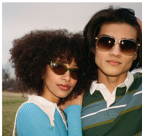
Kenmark Eyewear's Paradigm is created in partnership with Eastman. The collection is made from ISCC certified recycled materials, and includes both Eastman Acetate Renew and Eastman Tritan Renew material.