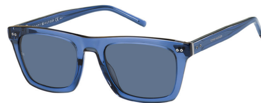
Polaroid and Tommy Hilfiger (r) are two of Safilo Group's brands that have recently introduced new, sustainable styles and innovations.