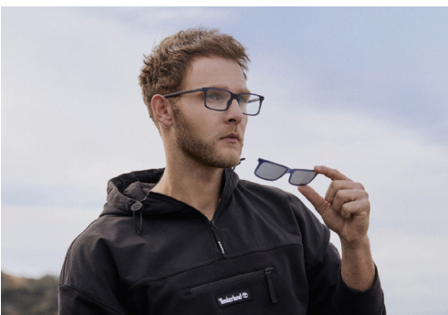
Marcolin’s Timberland launched its first “Earthkeepers” collection in 2011, manufactured with at least 35 percent bio-based plastic.