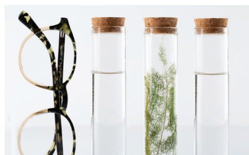
Botaniq, from Tura, is created from bio-acetate Natura that looks and feels like traditional acetate while being kinder to the environment overall.

Botaniq is made of Natura, a bio-acetate made up of 50 percent natural contents and available in a much wider variety of colors and textures than many other bio-acetates. The material can also be heated, treated and adjusted in the same manner as traditional acetate, making it a true, equal replacement for the material customers are used to.