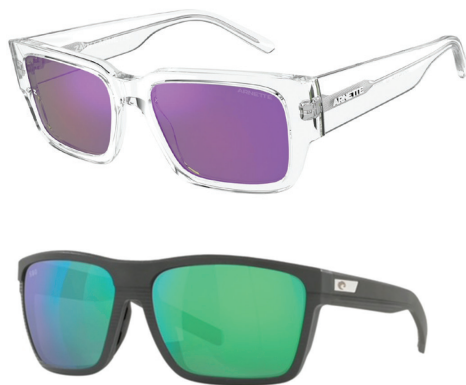
Luxottica’s Arnette (top) and Costa combine sustainable practices, style and function.

A number of Luxottica’s products and brands center on sustainability, and the company has introduced a variety of new, innovative bio-based materials into its profile of raw materials for all types of products. Specifically, Emporio Armani, Arnette, Burberry, Costa del Mar, Oakley and Starck Eyes all feature distinct eco-friendly collections or styles.